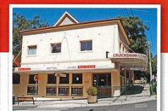
Wahroonga 9487 1500