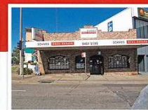
Thornleigh 9481 9199